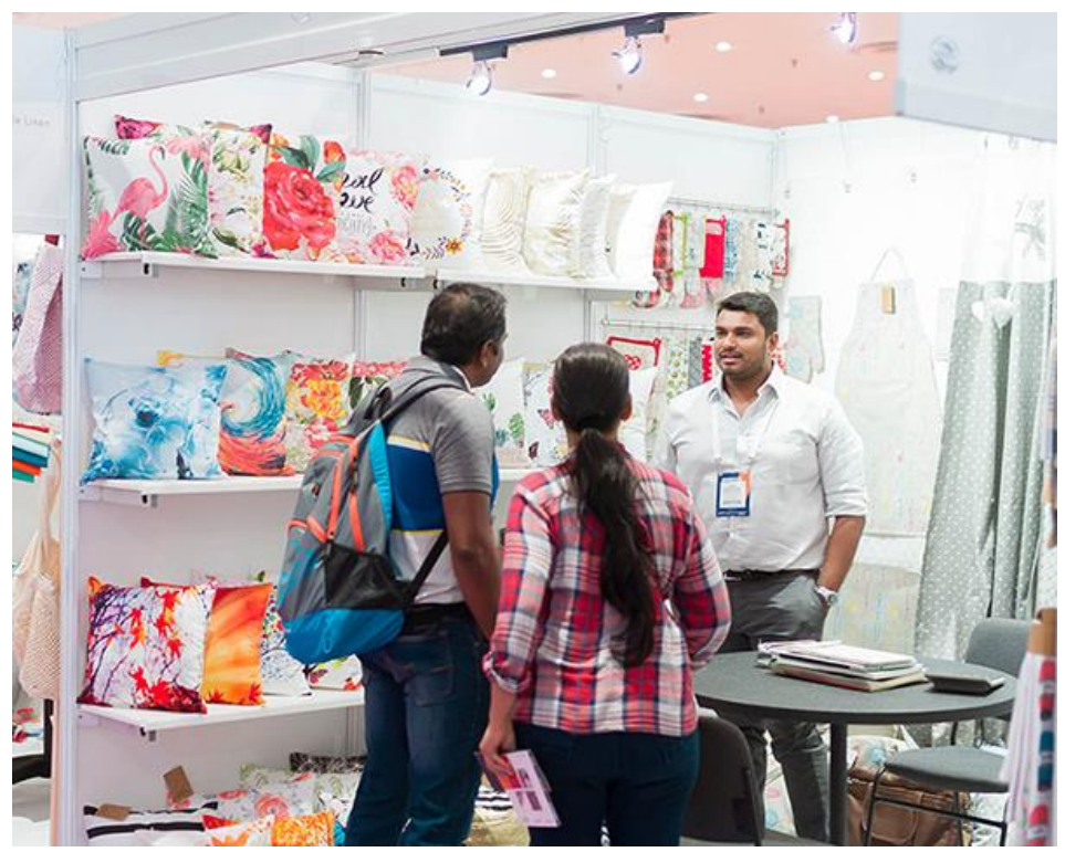
Along with the complimentary educational component, thousands of buyers, retailers and manufacturers have the opportunity to examine and explore

can be done now from a panel of global supply chain experts who will discuss how leading suppliers are addressing the changes, what types of production resources are available outside the big three home producers (China, India, Pakistan), how a small-footprint on-shoring operation could be set up to improve speed to market.